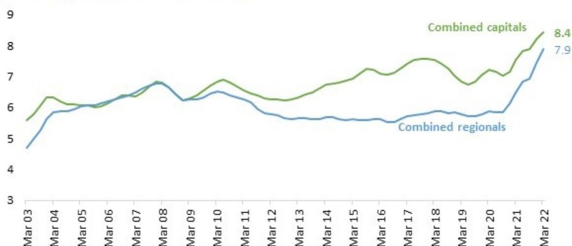
Dwelling value to income ratio

In 2003, it took less than 6 years of average full time earnings to buy an average dwelling in a city, and less than five years in regional areas. As of today, it takes 8.4 years of earnings in a city and almost 8 years in the regions to buy that same house.