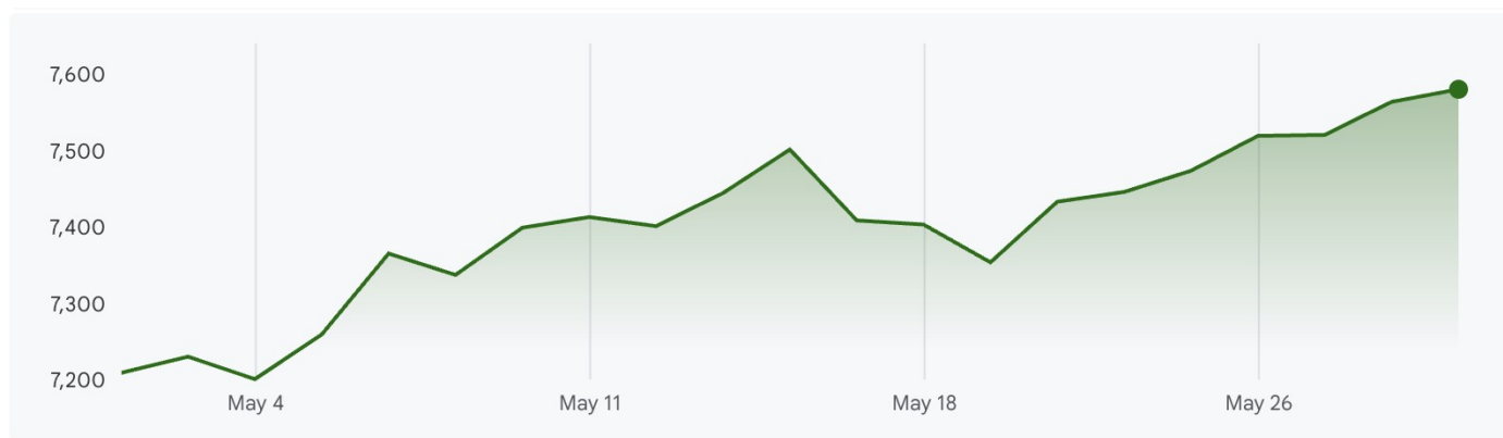
S&P 500 Performance in May 2026 - Google Finance

Turning our attention to the United States, the month of May 2026 was a stellar period for the US equity market, as evidenced by the S&P 500 chart provided in the graph below. Opening the month near 7,200 points, the index experienced a brief dip around May 4. This initial hesitation reflected investor apprehension following the Federal Open Market Committee meeting on April 29.